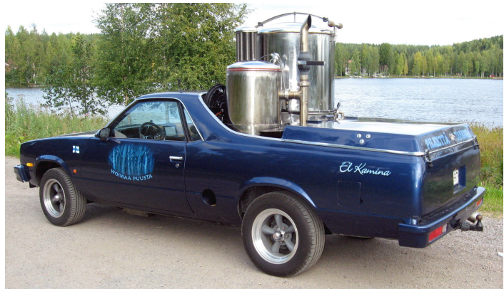
Super charged Chevrolet El Camino (renamed El Kamina), Finland

BOOK IS CONFIDENTIAL AND DELIVERED FOR PERSONAL USE ONLY AVAILABLE AS AUTHOR'S EDITION